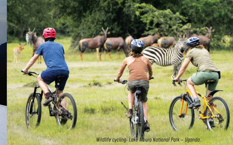
Wildlife cycling, Lake Mburo National Park – Uganda.