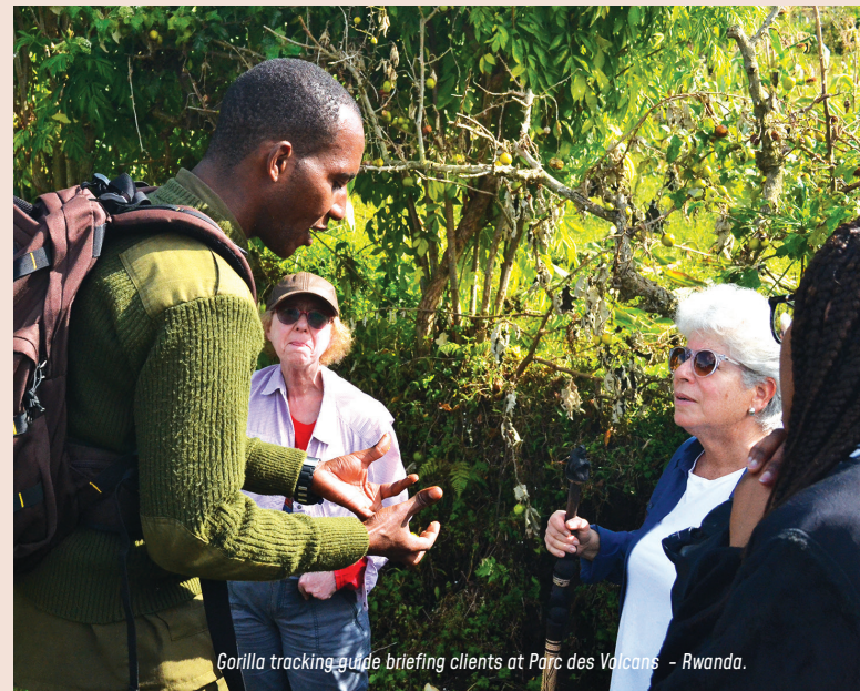
Gorilla tracking guide briefing clients at Parc des Volcans - Rwanda.

Our presence in both Uganda and Rwanda, gives our clients an opportunity to have cross border safari experiences with the same guides and safari vehicles.