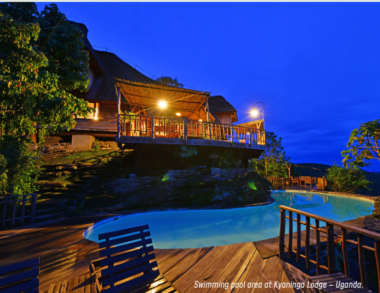
Swimming pool area at Kyaninga Lodge – Uganda.

Both Uganda and Rwanda offers a variety of accommodation categories, ranging from high-end to midrange giving travelers options depending on personal interest and budget.