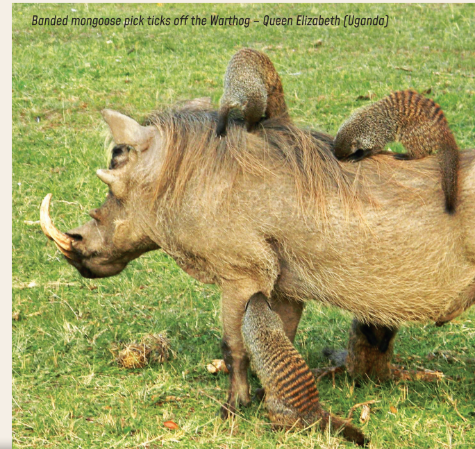
Banded mongoose pick ticks off the Warthog – Queen Elizabeth (Uganda)

Your day starts early in the morning (about 6am), join the research team, detailed briefing and head out to the impenetrable forest. When you get to the Gorilla family, your guide will take you through an in-depth explanation of how Gorilla behave, watch them as they groom and play with the young ones. Gorilla Habituation Experience can be part of the long trip or can be an independent adventure.