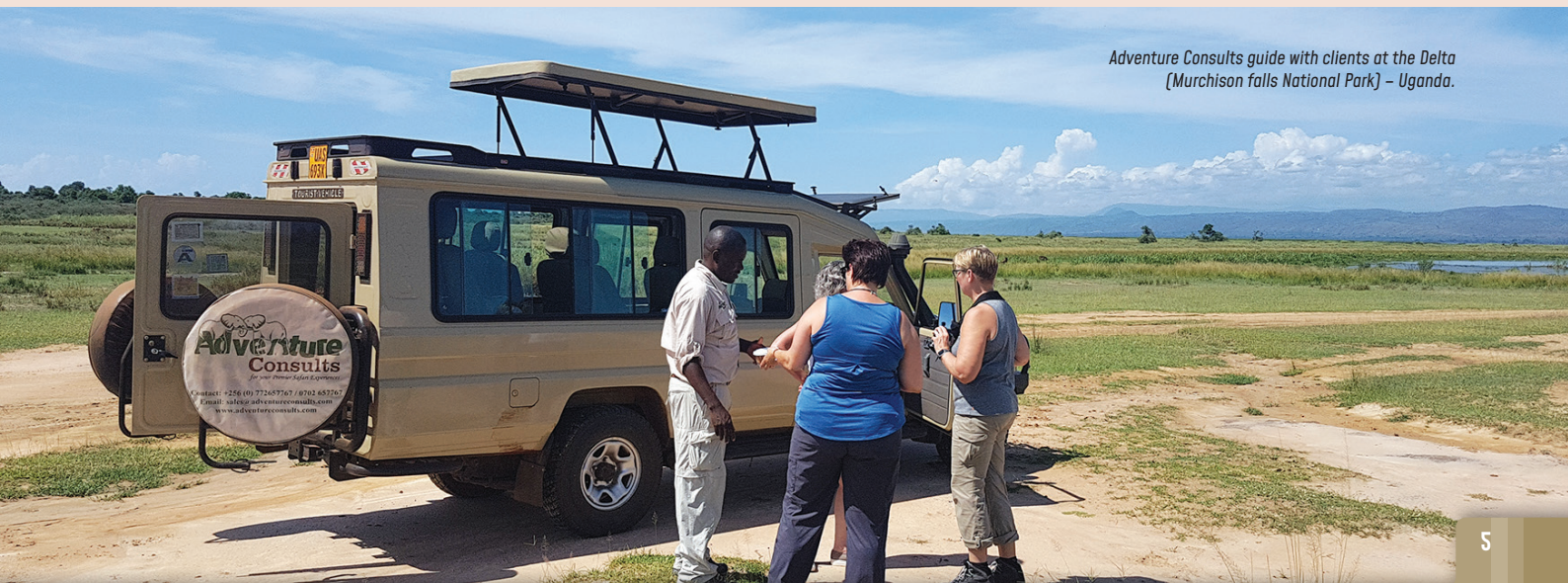
Adventure Consults guide with clients at the Delta (Murchison falls National Park) - Uganda.

We have a tour operators' public liability and evacuation insurance covered for every client on safari.