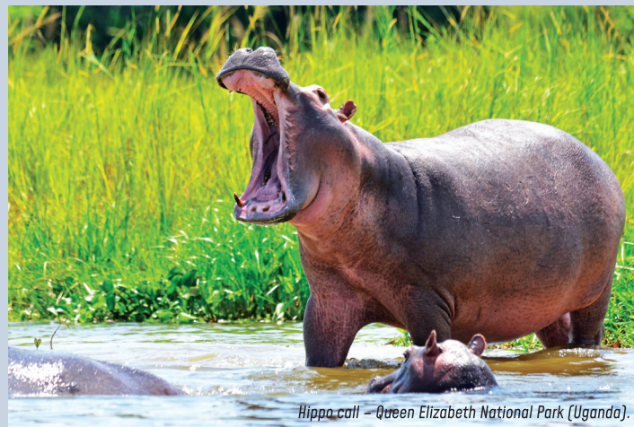
Hippo call – Queen Elizabeth National Park (Uganda).