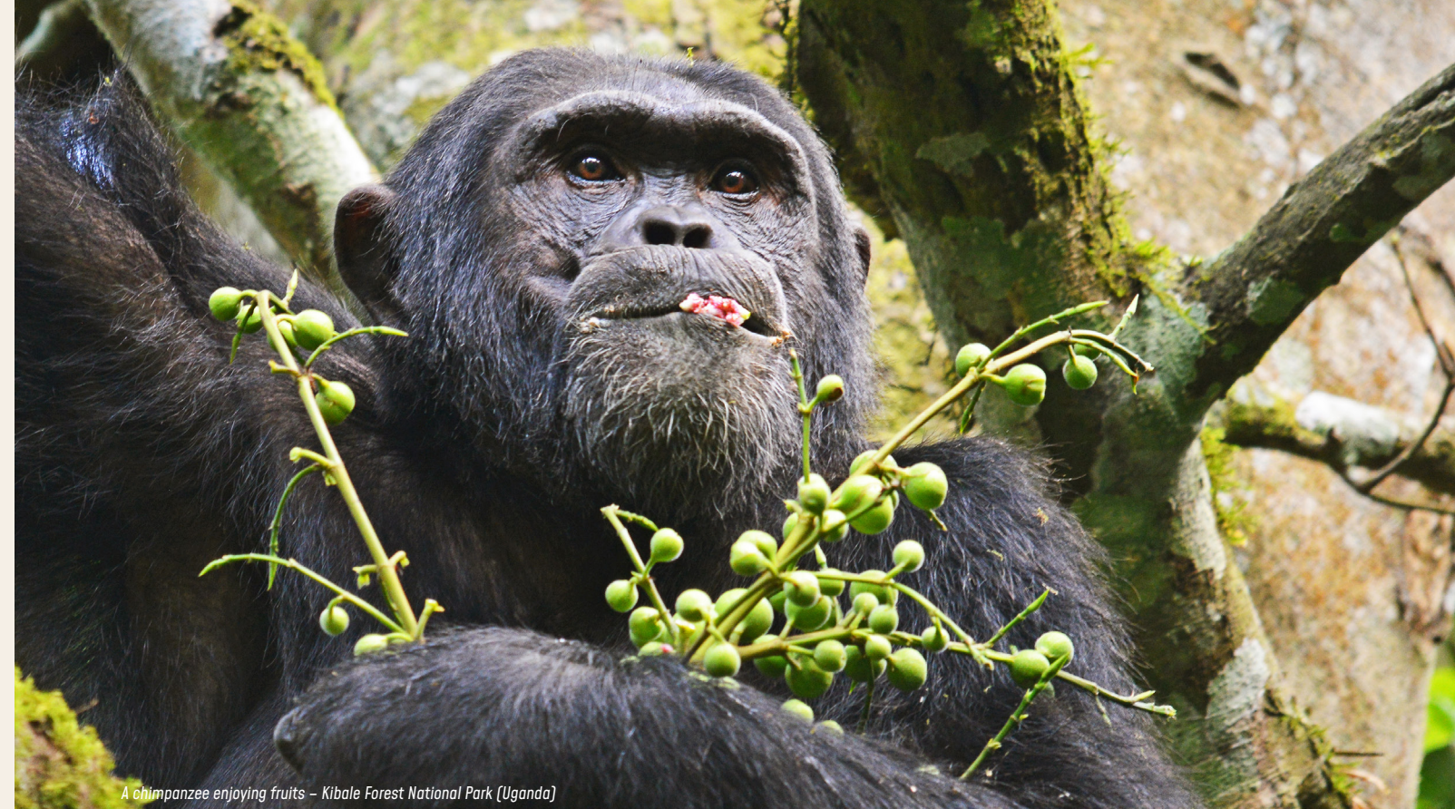
A chimpanzee enjoying fruits – Kibale Forest National Park (Uganda)