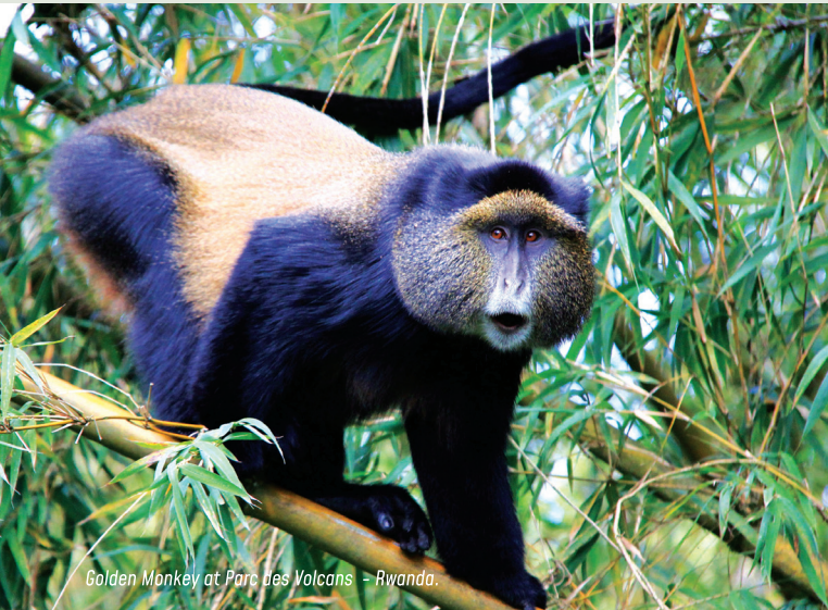
Golden Monkey at Parc des Volcans - Rwanda.

Deep in the southwest, Nyungwe Forest is the most extensive montane rainforest in the region that is home to many primates including the world's largest troops of Black and White Colobus Monkeys and Chimpanzees. North east of the country along the border with Tanzania is Akagera National Park with forest fringed lakes, papyrus swamps, savannah plains and rolling highlands. A city tour of modern and clean Kigali will take you to the genocide museum, which does a magnificent job explaining the history of the civil war and attempts to put a face on the countless lost.