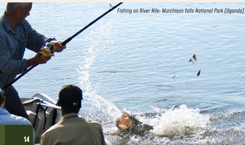
Fishing on River Nile, Murchison falls National Park (Uganda)

The River Nile is the lifeblood of Murchison Falls National Park and Lake Victoria (the second largest fresh water body in the world) offers the best fishing opportunities. Join our professional fishing guides for both private and small-group tours.