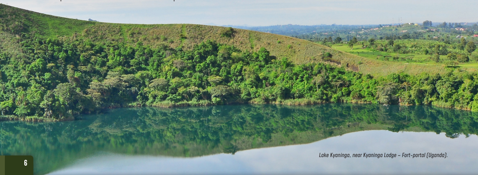
Lake Kyanninga, near Kyanninga Lodge – Fort-portal (Uganda).

Other than the traditional wildlife and primate trips, Uganda offers adventure trips, among others: Mountaineering, whitewater rafting, bungee jumping on the Nile, river safaris, horseback riding and walking safaris.