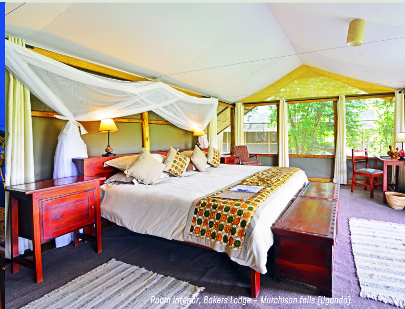
Room interior, Bakers Lodge – Murchison Falls (Uganda).

All Adventure Consults' safari packages include accommodation. Our team go out and do property inspections, check out every place, and know them inside out. The accommodation we recommend depends on the destination, and your personal requirements, but when you book a holiday with us, we always suggest, ask a few questions and ensure that you stay at the best possible accommodations.