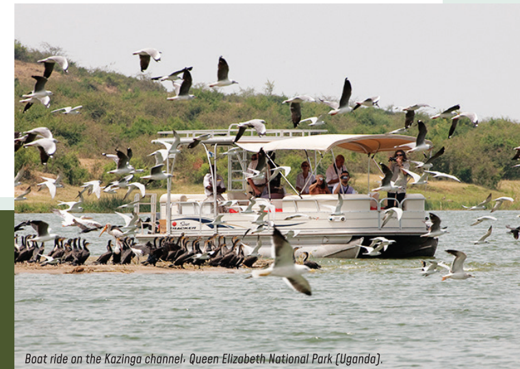
Boat ride on the Kazinga channel- Queen Elizabeth National Park (Uganda).