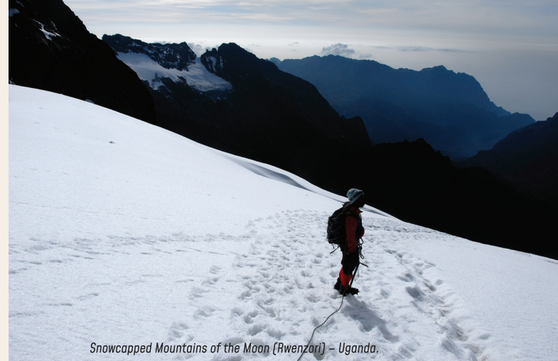
Snowcapped Mountains of the Moon (Rwenzori) – Uganda.