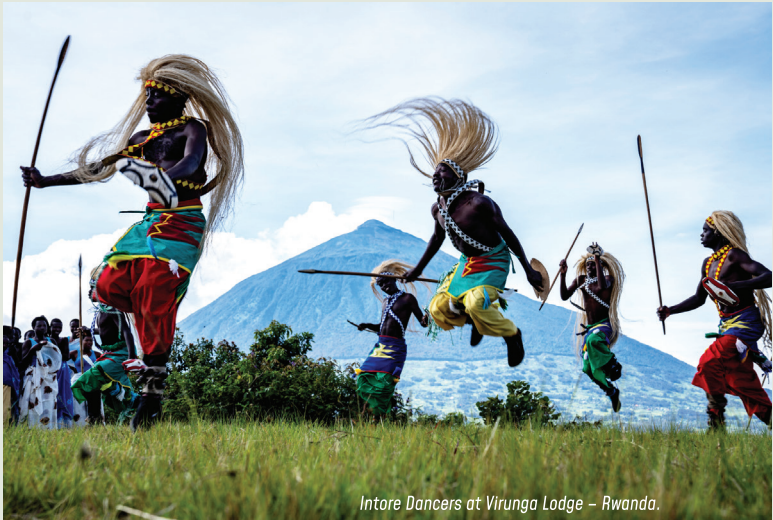
Intore Dancers at Virunga Lodge - Rwanda.

There's more to Rwanda than gorillas; on the shores of Lake Kivu are some of the best inland beaches on the continent.