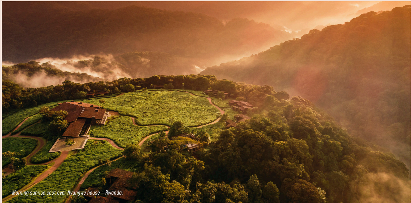
Morning sunrise cast over Nyungwe house – Rwanda.