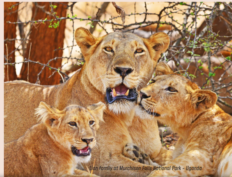
Lion family at Murchison Falls National Park - Uganda