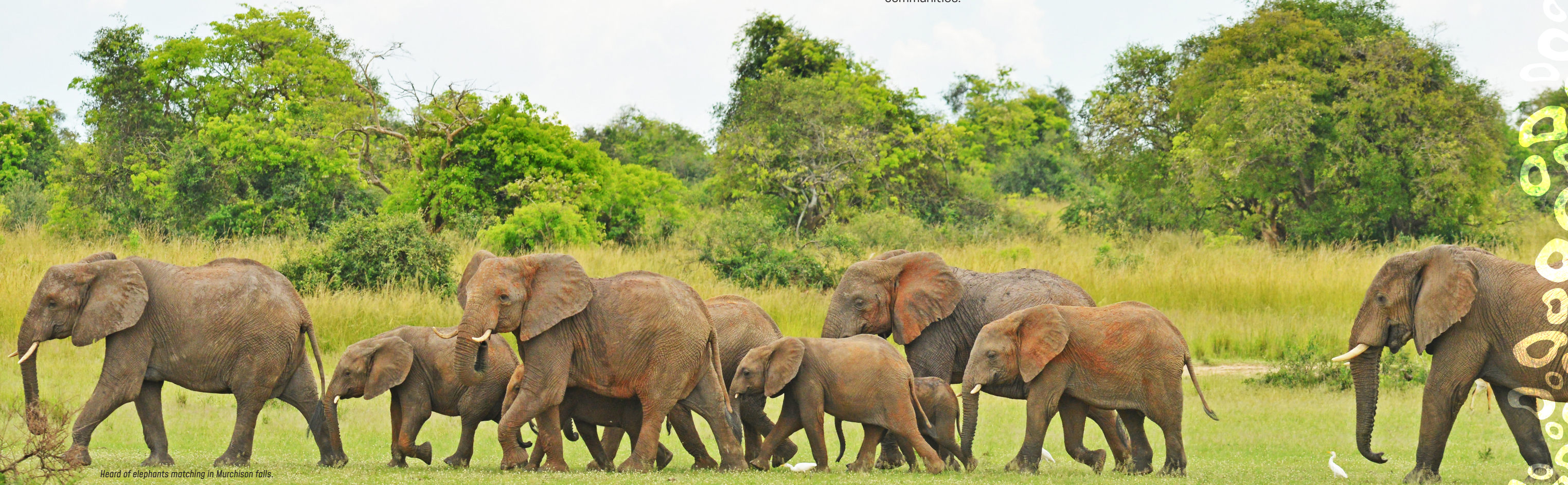
Heard of elephants matching in Murchison falls.

Our forte is to share knowledge, love and passion for exceptional destinations. Our approach to tourism, ensures minimal negative social and environmental impacts. We focus on generating greater economic and social benefits for local people and enhance the well-being of host communities.