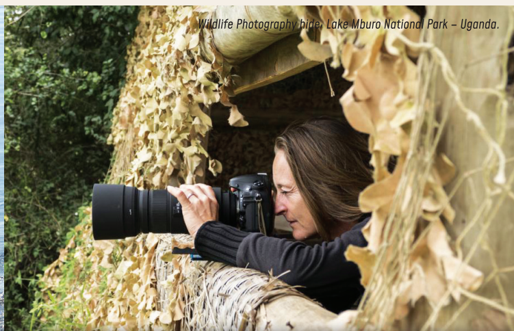
Wildlife Photography hide, Lake Mburo National Park – Uganda.

You are a tea person? We will take out for a tea tour and get to know how tea is grown, picked and traditionally processed. The tour also shows how ‘black’, ‘green’ and ‘white’ teas are produced and differentiated. You have an open invite to sample the fine teas at the end of the tour whilst looking over the impressive forests.