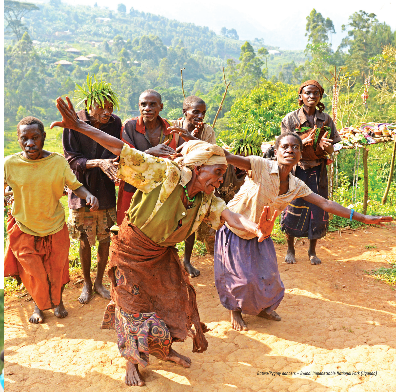
Batwa/Pygmy dancers – Bwindi Impenetrable National Park (Uganda)